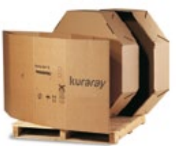
One-way octabin Dimensions: L 110 cm x W 110 cm x H 90 cm