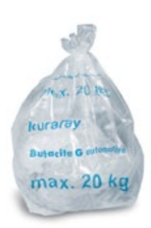
The PE bag must not weigh more than 20 kg.

Trimmings must be collected either directly in colorless PE (polyethylene) bags provided for this purpose (see chapter provided materials) or they can be initially placed in very clean plastic or metal bins and then transferred to aforementioned PE bags. The following advises how to return the PE bags.